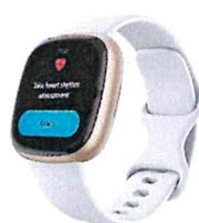
Fit Bit Sense Watch